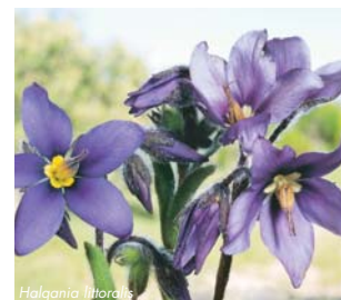
Red Bluff, Kalbarri National Park