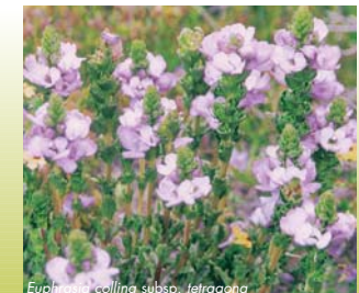
Euphorbia collina subsp. tetragona