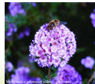
Verticordia plumosa subsp. plumosa